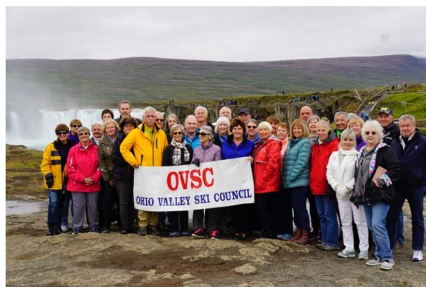
Photos from the Iceland and Denmark trip